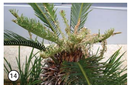
Frizzletop on Cycas revoluta in Hawaii

Dear Fellow Coneheads, (Ed.'s Note: This is the name of the Yahoo Discussion Group for the Cycad Society's Board of Directors)