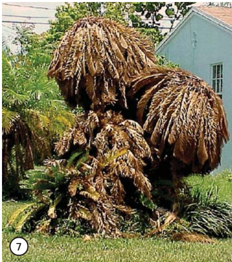
7 Cycas revoluta with a heavy infestation of Aulacaspis scale .