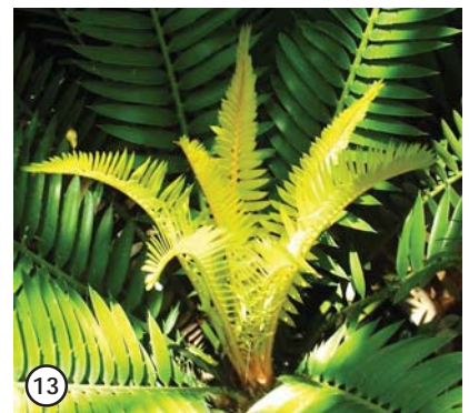
New flush of Encephalartos senticosus with yellow leaflets and orange petioles