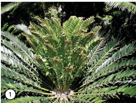
Normal green flush of Encephalartos ferox