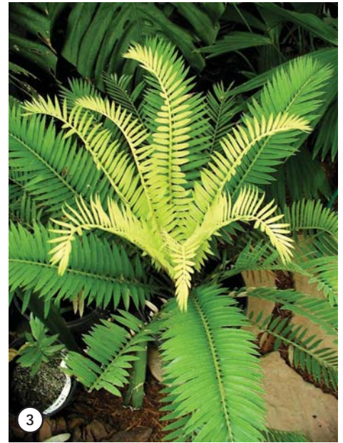
Lemon yellow flush of Encephalartos senticosus

The recent discussion on the [cycad] Yahoo group about off-color leaf flushes was initiated by a collector in Germany who was concerned that his Encephalartos horridus might have a disease because it was flushing a brilliant orange color (Fig. 6). Since the plant had never done this before, he figured it must be sick. As far as I know, there aren't any diseases that would cause new leaves to flush off color. Certain pest insects, such as Aulacaspis scale, can cause leaves to turn yellow and then brown if left untreated (Fig. 7). However, an infestation that would cause complete chlorosis of an entire set of leaves would be quite obvious and unmistakable (Fig. 8), and I am not aware of any such pests that affect Encephalartos plants the way the aulacaspis scale affects plants of the genus Cycas . Furthermore, insects just would not cause the vibrant colors in newly emerging leaves in the manner being discussed here. A final thought is that some people may consider nutrient deficiencies to be some sort of disease, or they may not know the difference between a deficiency and a disease. For