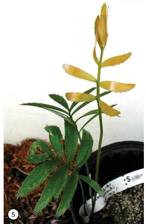
Burnt orange flush of Encephalartos whitelockii seedling