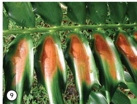
9 Sunburn on an Encephalartos ferox leaf

As mentioned above, nutrient availability—or lack thereof—can cause