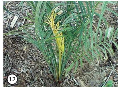
Uniform yellow flush of Macrozamia sp.