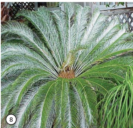
8 An untreated infestation of Aulacaspis scale can cause fairly rapid death of the plant, as in this Cycas revoluta in Homestead, FL

the record, a deficiency is definitely not a disease, and it is important to be able to tell the difference. I will address nutrient deficiencies in a later section.