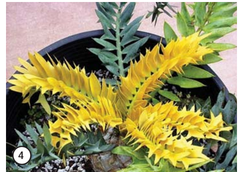
Golden yellow flush of Encephalartos horridus