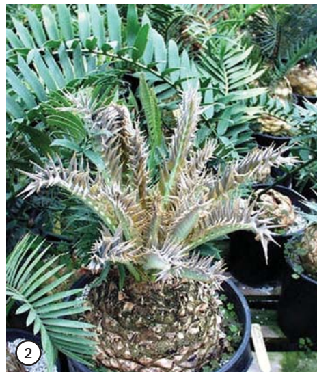
Normal gray-blue flush of Encephalartos horridus