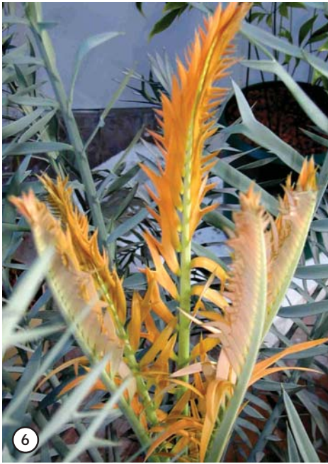
6 Orange flush of Encephalartos horridus