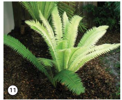
Nearly white flush of Dioon mejiae